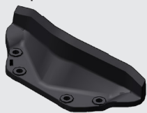
Top knife, Standard